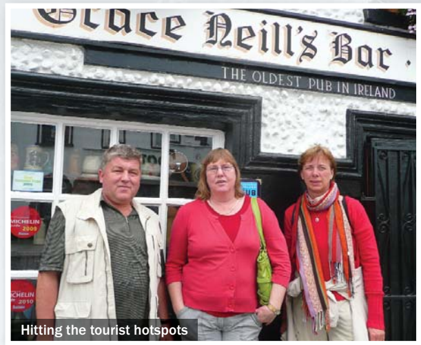
Hitting the tourist hotspots