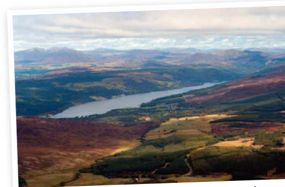
A view towards Pitlochry across Loch Tummel and the Queens View