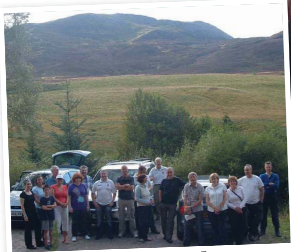
Looking from the car park at Braes fo Foss towards Schiehallion

The peaks that are to be climbed at the same time on the same day are Ben Nevis in Scotland, Scafell in England, Snowdon in Wales and Slieve Donard in Northern Ireland. Please note that this is not a four peak challenge just a hillwalking day with all four peaks being climbed by IPA members and guests who can select which mountain they wish to climb.