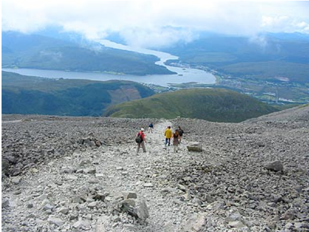
Above – Descending the tourist track