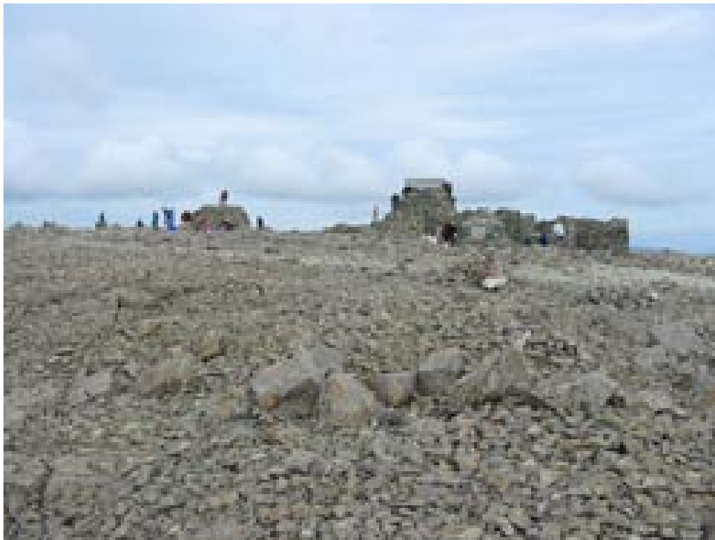
Below – The summit of Ben Nevis