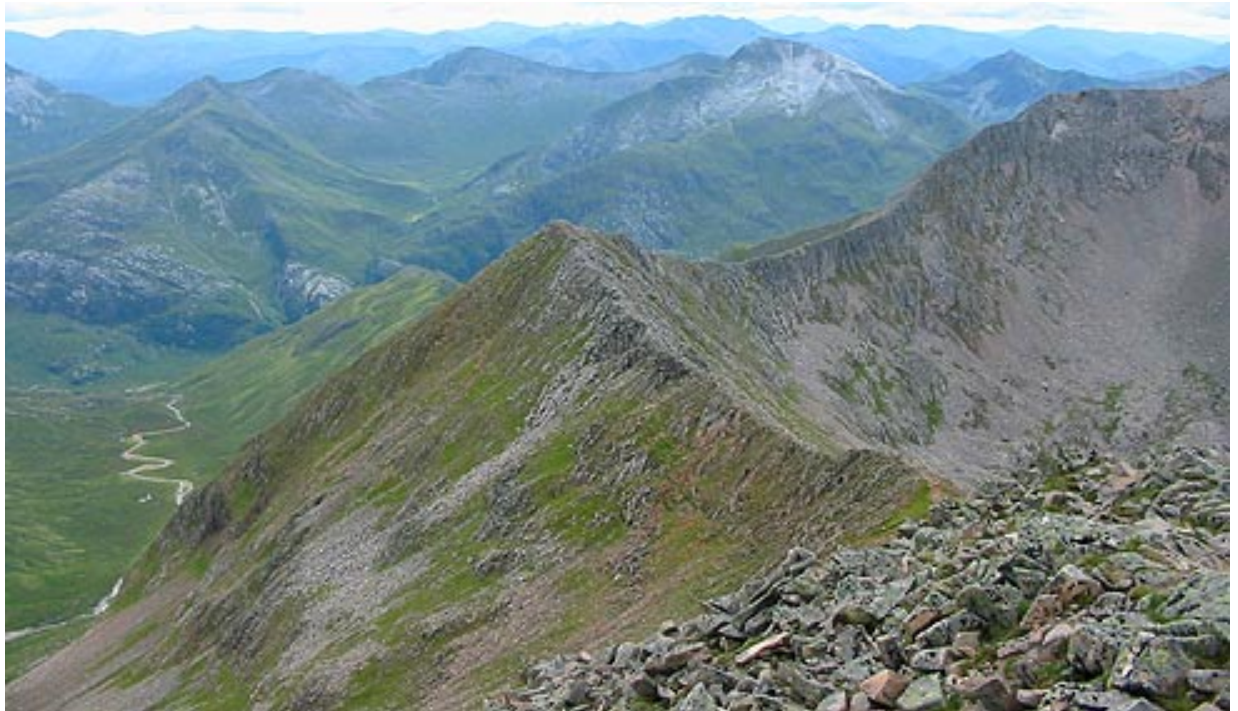
Above – The Carn Mor Dearg Arête. The Arête rises in the distance towards the summit