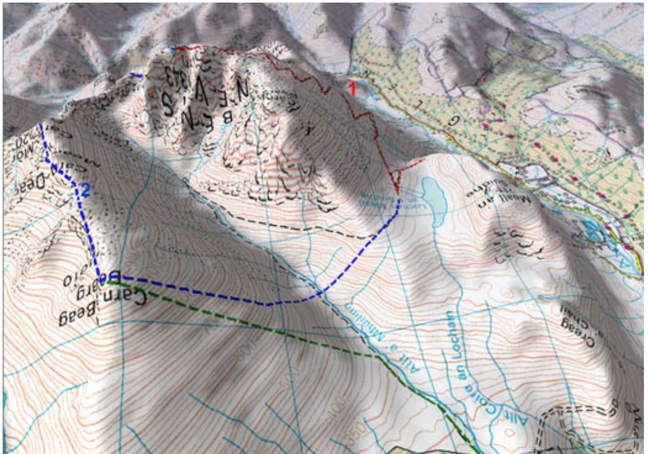
Below - Map showing Pony or Tourist Track and Carn Mor Dearg Arête route